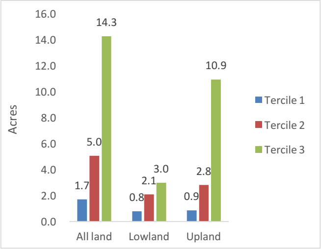
Figure 1: Mean operated agricultural landholding, by landholding tercile.

Farm landholdings are unequally distributed. The average area operated by the largest third of farms (tercile 3) is 14.3 acres. This is more than 8 times greater than that of the smallest farms (tercile 1), which operate on average only 1.7 acres [Figure 1].