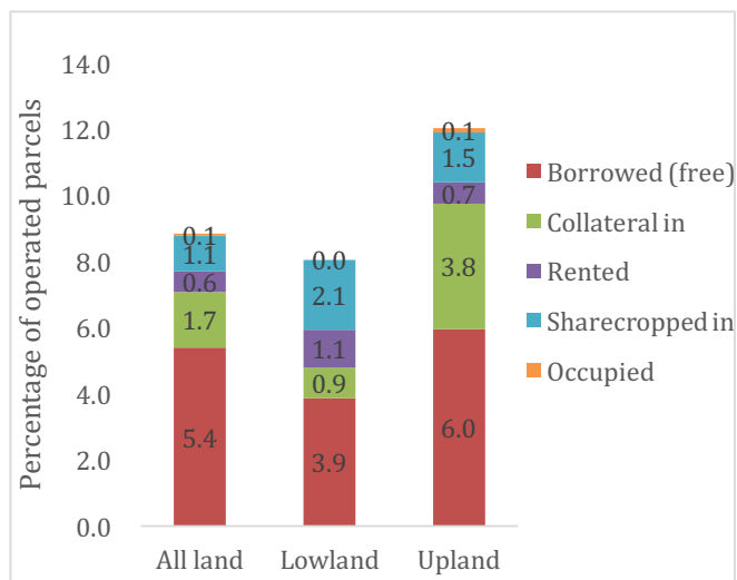
Figure 3: Share of operated parcels by tenure arrangements other than ownership. 2

are so low or unpredictable that even larger farmers are unwilling to give up land or, conversely, that potential tenants are unwilling to risk advancing cash rents.